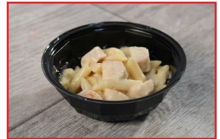
Alfredo Chicken Pasta