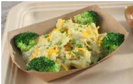
Broccoli Cheddar Pasta Bake