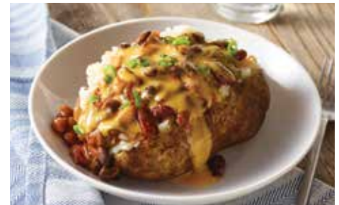
Chili Cheese Baked Potato