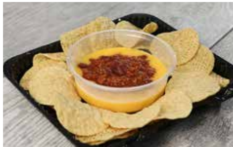
Chili Con Queso Nachos